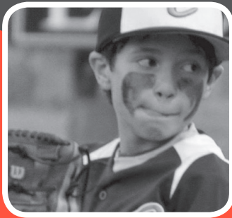
indoor baseball training facility